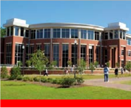
Georgia Southern University